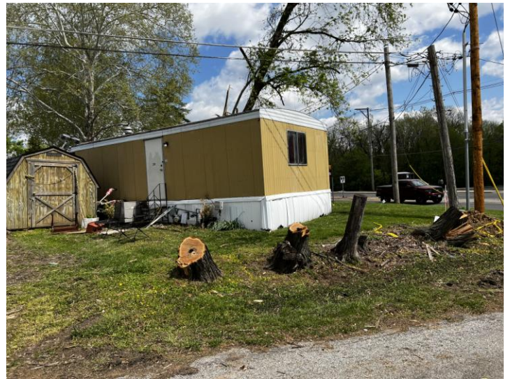
Pawnee Drive at North Illinois St.