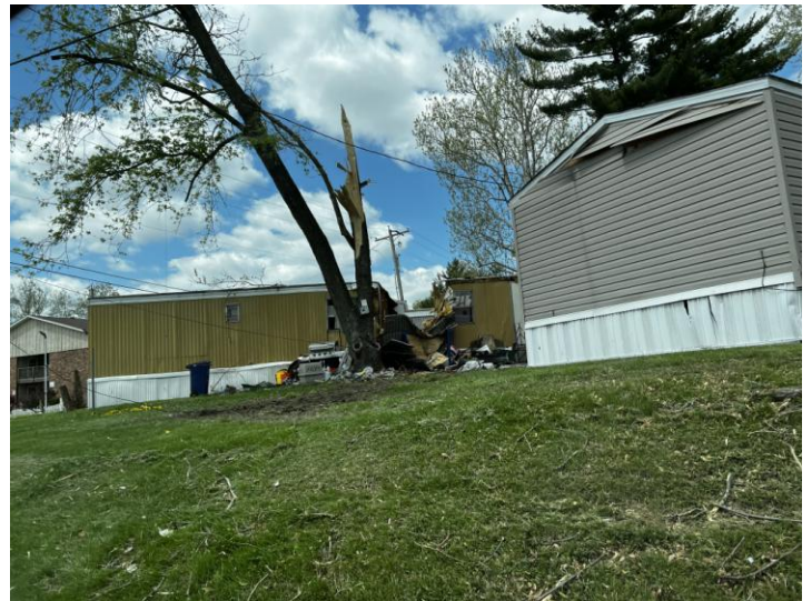
A tree cut this trailer in half