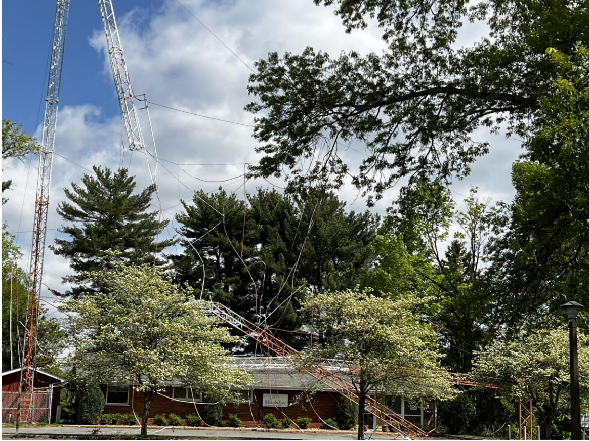
Ex WMYR-FM Antenna Tower lays on Studio Building