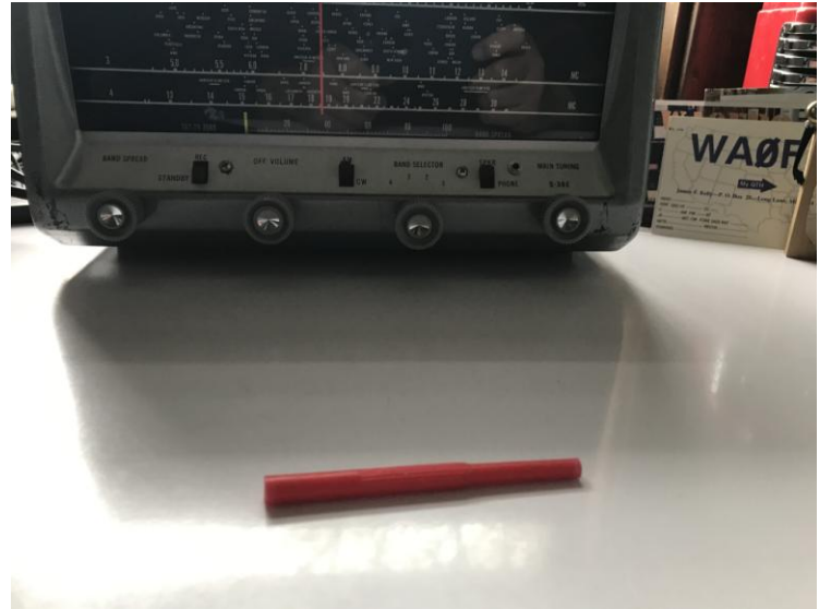
No, not the S-38 although it's the same vintage!