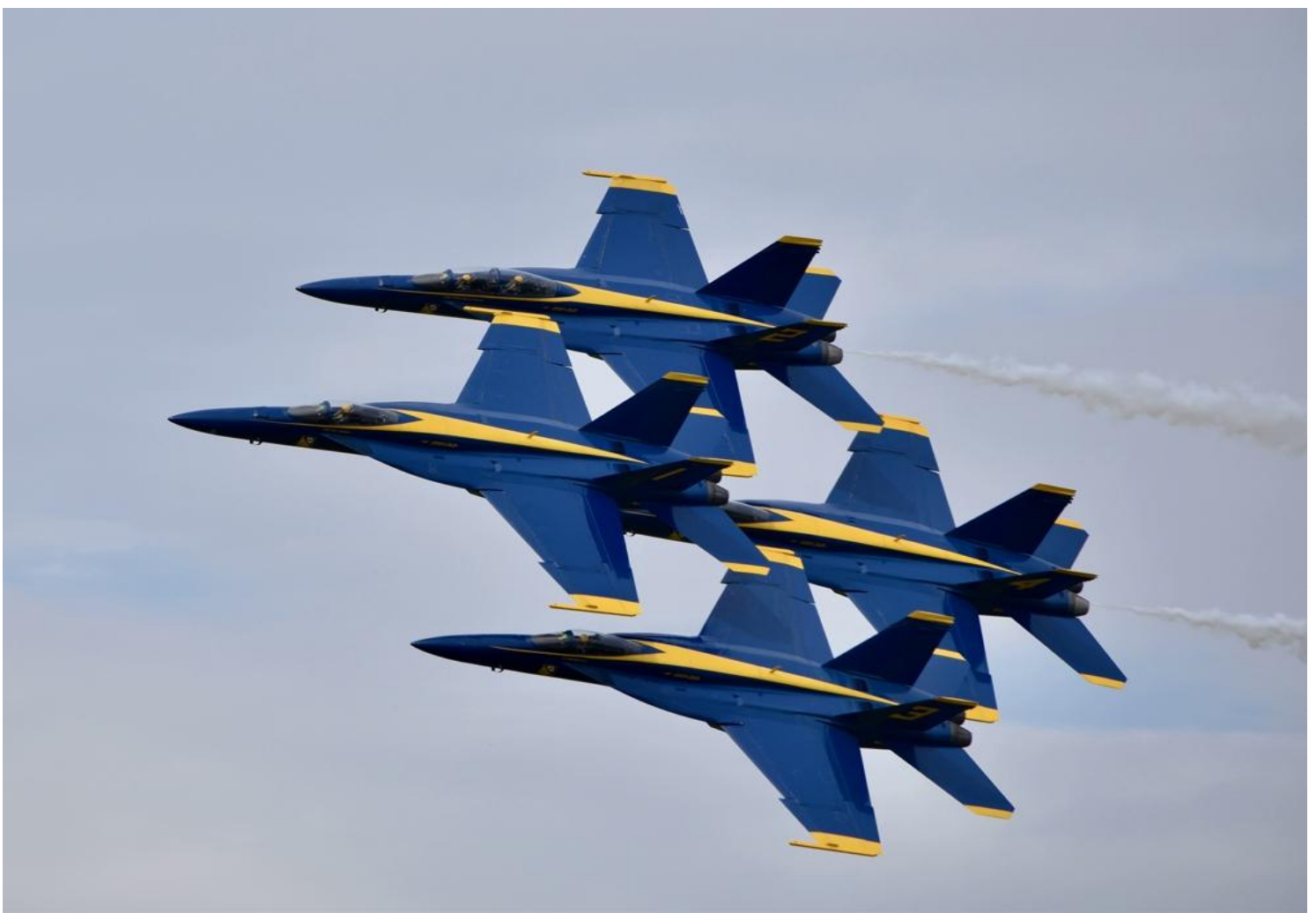
F/A-18E Super Hornet "Number 1 -4"