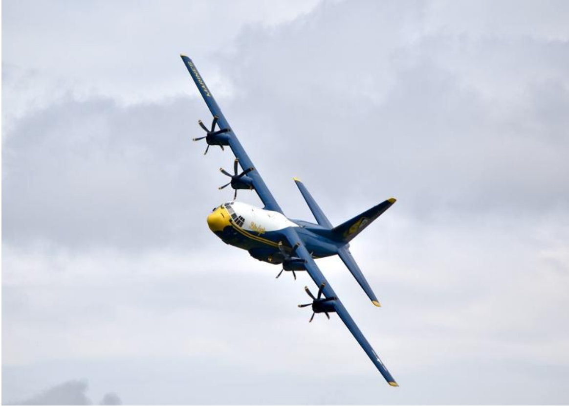
C-130J Super Hercules "Fat Albert"