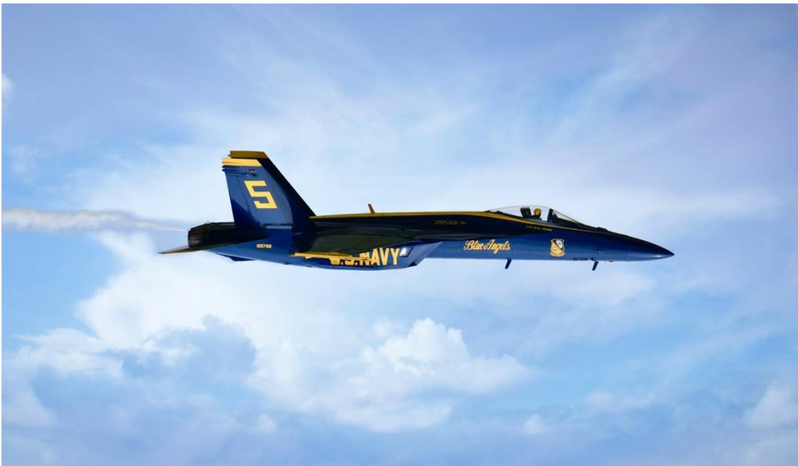
F/A-18E Super Hornet "Number 5"