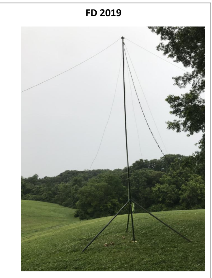
Dean's, K9JDW; G5RV was very easy to install, even in the rain.