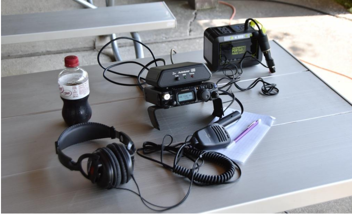
Julio's AA2KF, QRP station