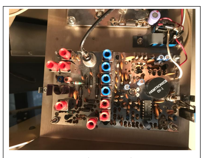
Hamtronics 220 MHz Exciter