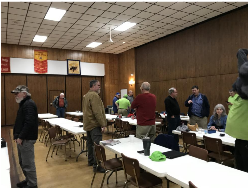
After meeting Rag Chew 2-25-23