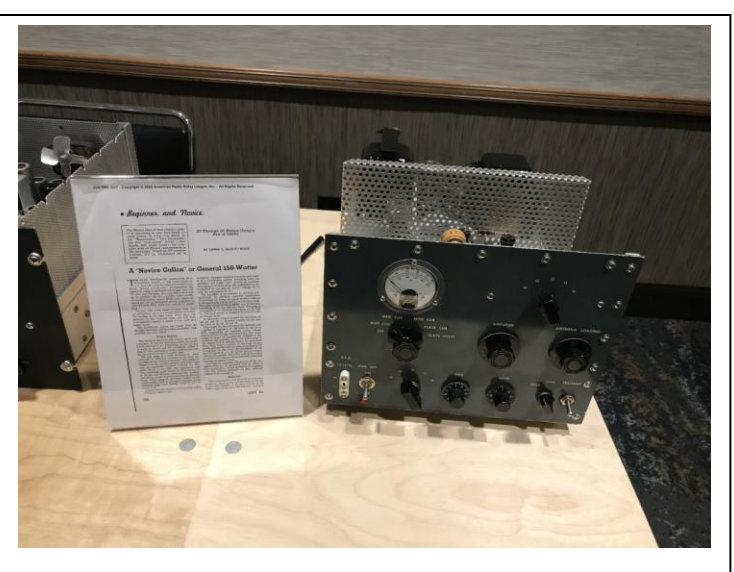
"Novice Gallon or General 150-Watter" QST June 1962