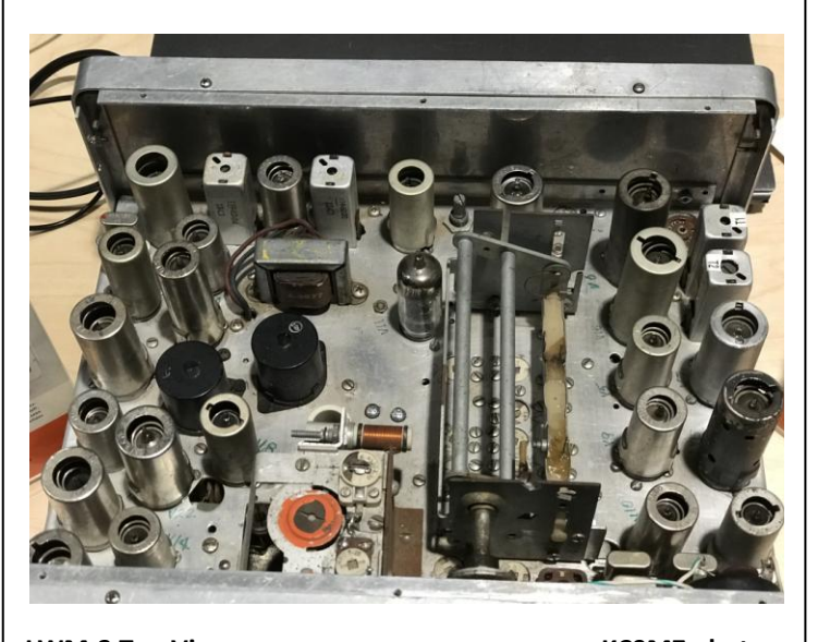
LWM-3 Top View