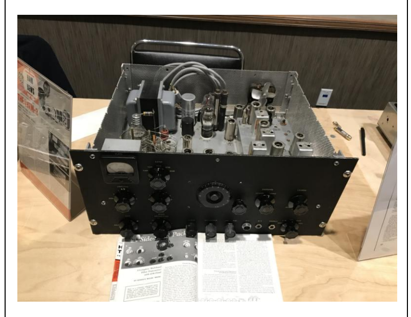
"A Sideband Package" QST June 1958