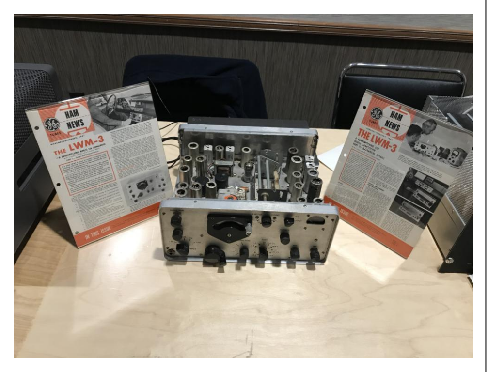
Transceiver from the Nov 1961- Feb 1962 GE Ham News