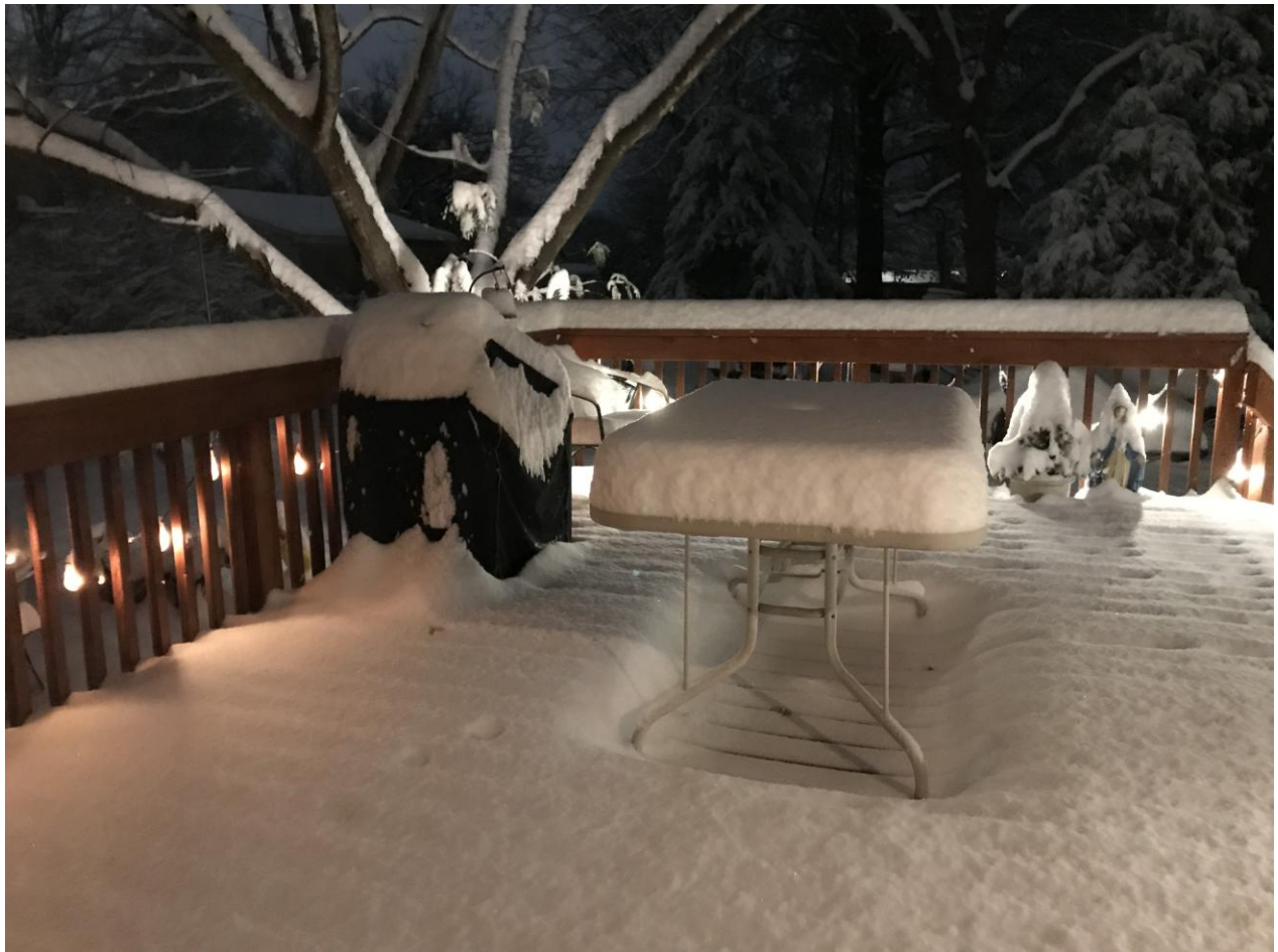
7" measured at my QTH! First snow of the season!